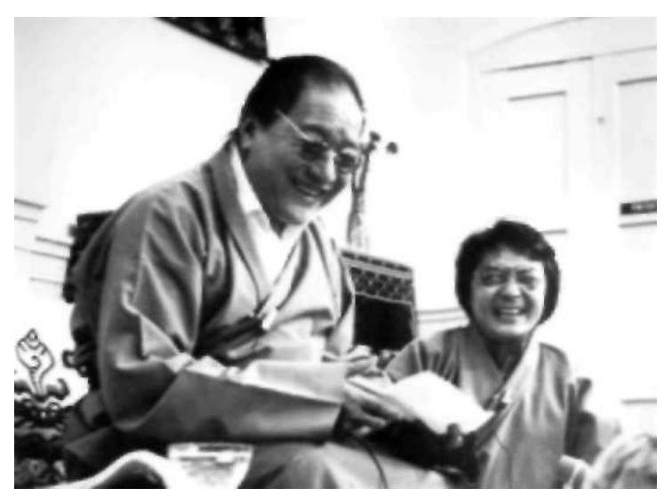
Dudjom Rinpoche teaching and Sogyal Rinpoche translating. London, 1979.

Dudjom Rinpoche (1904-1987), one of Tibet's foremost yogins, scholars, and meditation masters. Considered to be the living representative of Padmasambhava, he was a prolific author and revealer of the 'treasures' concealed by Padmasambhava.