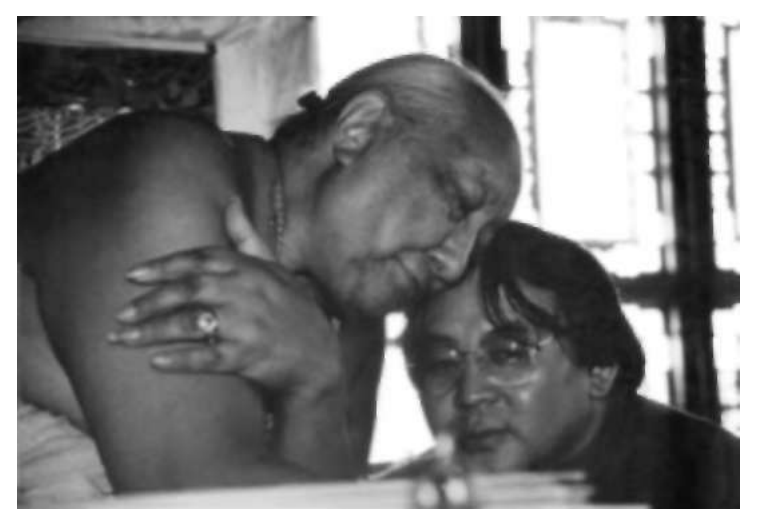
Dilgo Khyentse Rinpoche and Sogyal Rinpoche.